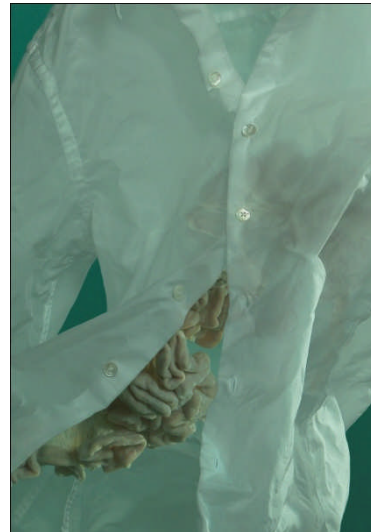
Liquid Ground 2 (detail)