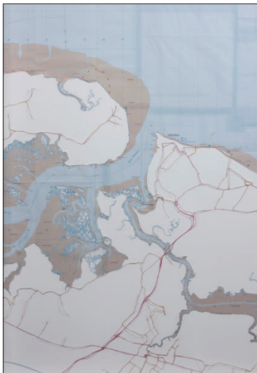
Thames 1 (detail), 2010, hand-cut ordnance survey maps on rag board, 75 x 47 cm