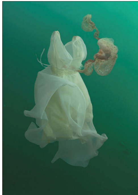
Liquid Ground 1 (detail), 2010, C-type photographic print, face mounted on glass, 160 x 110 cm

GV Art Gallery, 49 Chiltern Street, Marylebone, London W1U 6LY