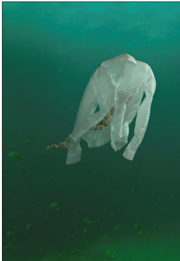
Liquid Ground 2 , 2010, C-type photographic print, face-mounted on glass, 160 x 110 cm